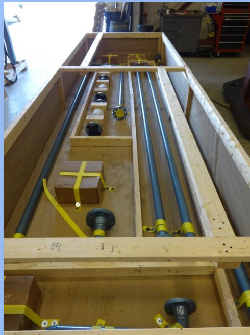
Fabricated Painted Carbon Steel Pipe Spools Boxed for Shipment

Pipe spools can be fabricated to ASME B31.1, B31.2, API and PED Standards by highly skilled and qualified fitters and welders.