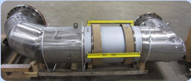
Fabricated Process Pipe Spools with Mitred Elbows and Internal Turning Vanes