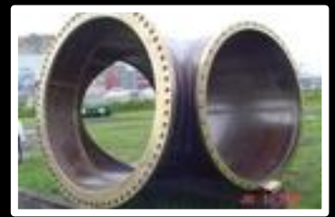
89" Discharge Head for a Vertical Pump

Our experience with heavy rigging and safe, careful handling of oversize components along with our capacity, mechanical skill set, and knowledge of rotating machinery assembly, fit, and function allows us to assemble and ship large equipment as complete assemblies. Many large pumps may otherwise have to be shipped in sections and assembled on-site at a much greater cost and with some reduced quality simply due to environmental factors and conditions. GJO has shipped large pump assemblies weighing over 100,000 pounds.