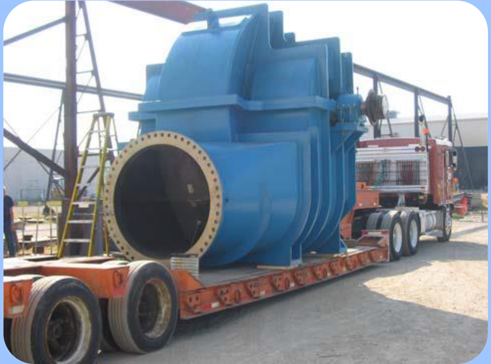
Large Horizontally Split Centrifugal Pump Assembled Complete with a New GJO Fabricated Replacement Pump Casing of the Original Worn-Out Cast Type Casing

Our goal is to partner with our customers to provide timely solutions for restoration and repair of rotating equipment assemblies and/or their components.