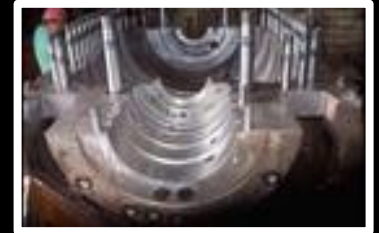
Fabricated Centrifugal Compressor Case